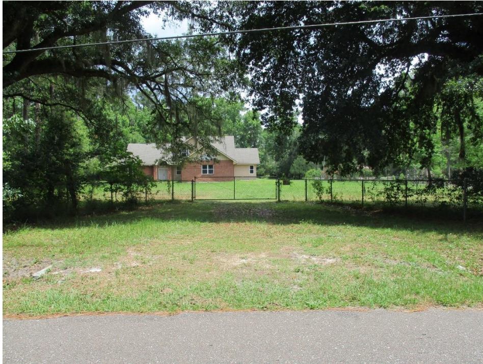
View of the neighboring Property that is located in the middle of the Proposed Development. Date: June 11, 2019