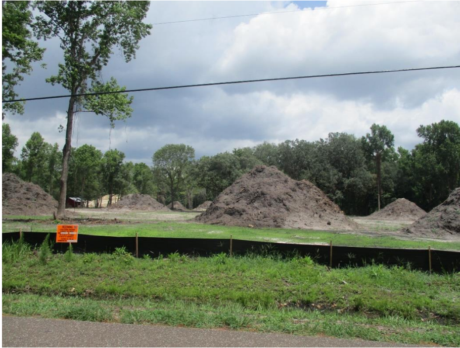
View of the central portion of the Subject Property.

Date: June 11, 2019