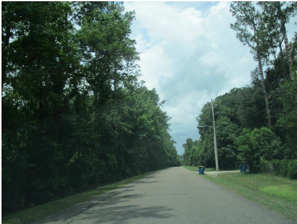
View from the eastern property line looking down Percy Road towards Lem Turner Boulevard. Date: June 11, 2019