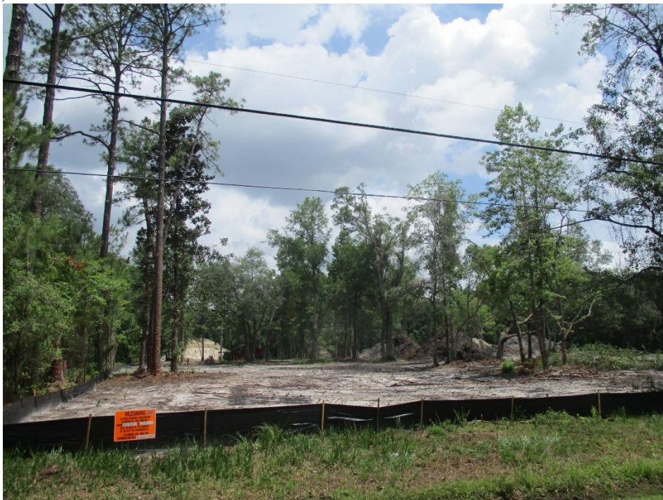
View of the western portion of the Subject Property.

Date: June 11, 2019