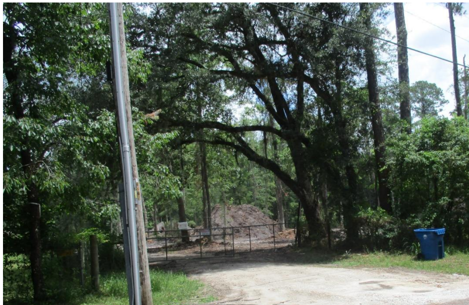
View of the eastern portion of the Subject Property.

Date: June 11, 2019